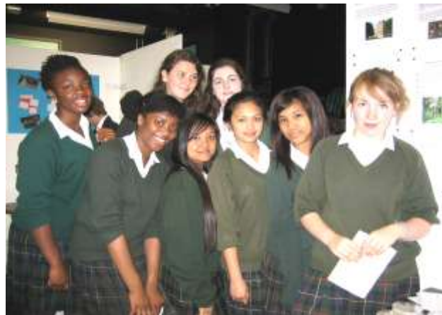
La Sainte Union Winners of Best Silver CREST Award